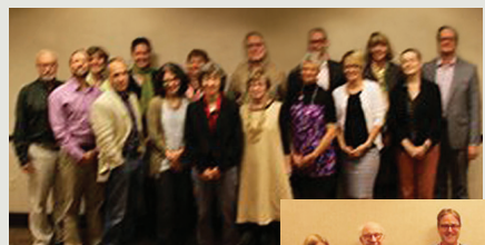
GSA Executive Board at 2014 Conference

The GSA is led by a Board of Directors and the officers listed below. With the exception of the Executive Director, the Secretary-Treasurer, and the GSR Editor, all Board members are elected by the membership and serve fixed terms. The Association is governed through its By Laws that are approved and amended by its members.