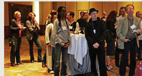
GSA Conference Participants at DAAD Reception in 2014