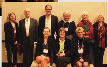
Gathering of GSA Presidents Past, Present, and Soon-to-Be at 2014 Conference

The GSA is led by a Board of Directors and the officers listed below. With the exception of the Executive Director, the Secretary-Treasurer, and the GSR Editor, all Board members are elected by the membership and serve fixed terms. The Association is governed through its By Laws that are approved and amended by its members.