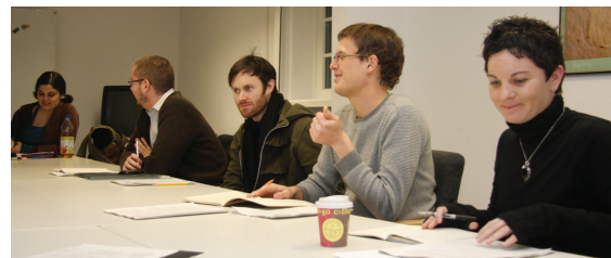
Berlin Program Students, Free University of Berlin

American Association of Teachers of German (AATG) American Council of Learned Societies (ACLS) Austrian Cultural Forum New York and Washington D.C. (ACFNY) American Institute for Contemporary German Studies (AICGS) Austrian Embassy Berghahn Books Central European History Society Deutsche Forschungsgemeinschaft (DFG) Documentation Archive of the Austrian Resistance (DÖW) Freie Universität Berlin/Berlin Program Friends of the Alexander von Humboldt Foundation Friends of the German Historical Institute (GHI) Friends of the German Literature Archives, Marbach German Academic Exchange Service (DAAD) German Embassy, Washington D.C. German Historical Institute (GHI), Washington D.C. Goethe Institut North America H-German International Association for the Study of German Politics (IASGP) Johns Hopkins University Press National Humanities Alliance (NHA) Swiss Embassy United States Holocaust Memorial Museum (USHMM) Women in German (WIG) Zentrum für Zeithistorische Forschung Potsdam And numerous universities, colleges, research centers, libraries, archives, and museums in North America, Europe, and elsewhere.