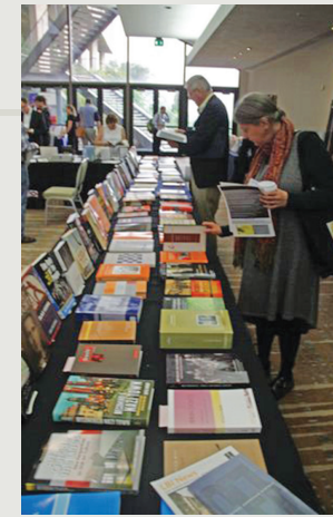
Book Browsing between Sessions