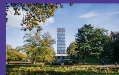
The Arts Tower, the tallest academic building in the UK