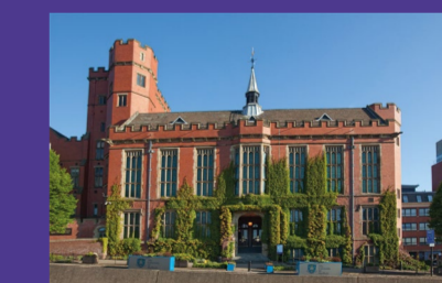
Firth Court, our iconic red brick building

out of 250 universities in Europe for teaching excellence (Times Higher Education Europe Teaching Rankings 2019)