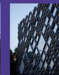
The Diamond, home to state-of-the-art laboratories and creative media suites