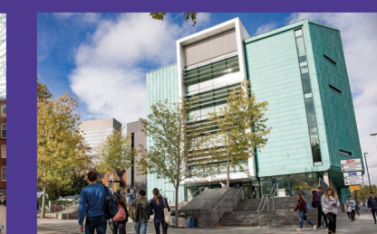
Study anytime in the Information Commons, open 24 hours a day, 7 days a week