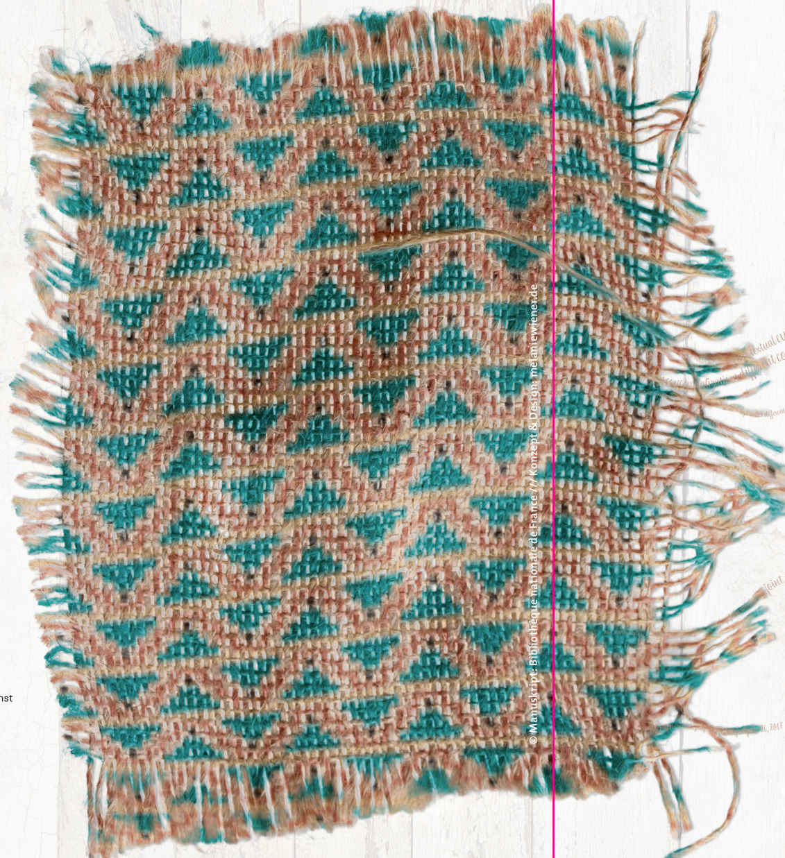
© Manuskript: Bibliothéque nationale de France // Konzept & Design: melaniewenck.de