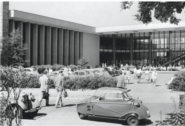
View of the Henry Ford Building from Boltzmannstraße in 1959.