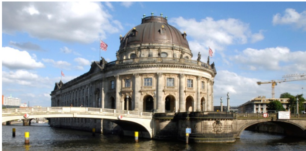
Das Bodemuseum Staatliche Museen zu Berlin / Bernd Weingart

Guided tour at the Museum Island – World Cultural Heritage